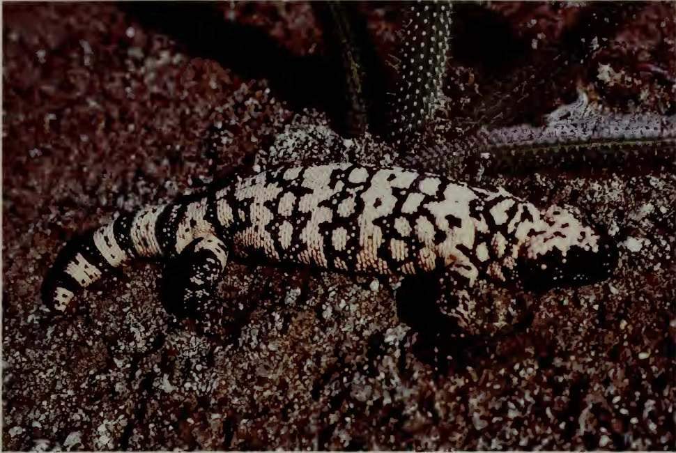
Fig. 3. Same Gila monster in Figure 3 photographed while at the Los Angeles Zoo.

desert at that time, and the fact that the specimen was diagnostic of the geographically expected race, H. suspectum cinctum . Figures 2 and 3 clearly show the banded pattern typical of this subspecies. De Lisle (1986) indicated that specimens from the Providence Mountains were mostly pink with a reduction in black pigmentation relative to other H. suspectum .